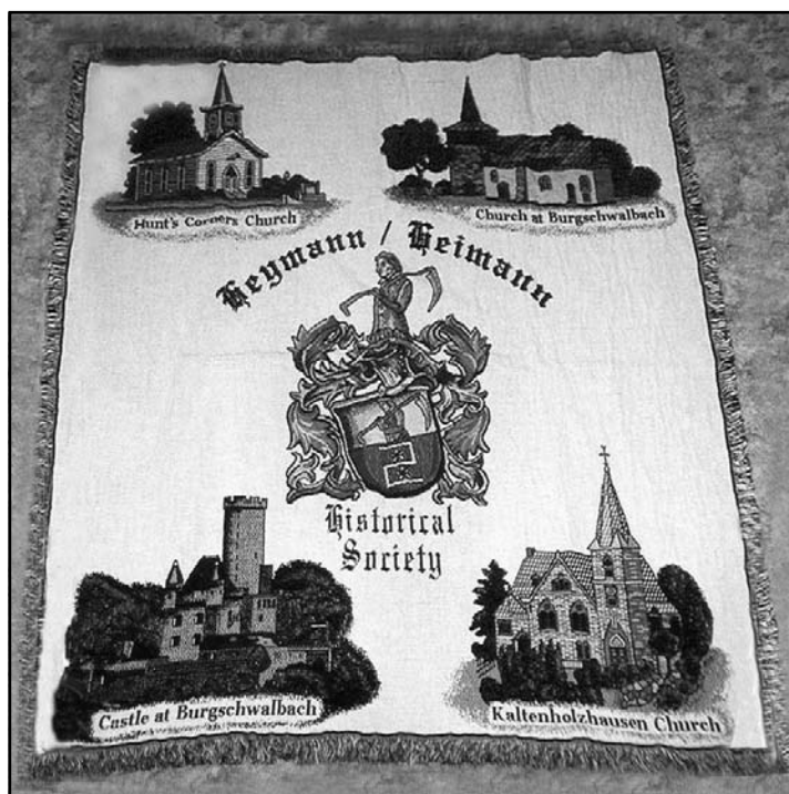
Tapestry Afghan.