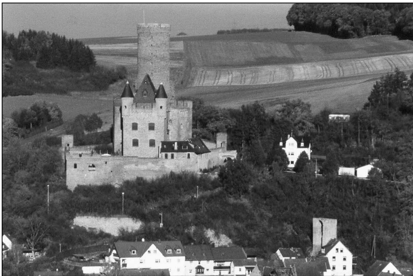
Castle at Burgschwalbach

The Heymann Historical Society is pleased to announce a Heymann Cousins 5th Trip to Europe with departure scheduled for August 8, 2006. For information on how you can participate in this exciting trip, see the details including a daily itinerary and registration information inside in this issue.