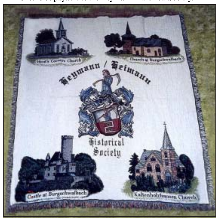
Tapestry Afghan.

Please note: Payment must accompany each order. Checks should be payable to the Heymann Historical Society.