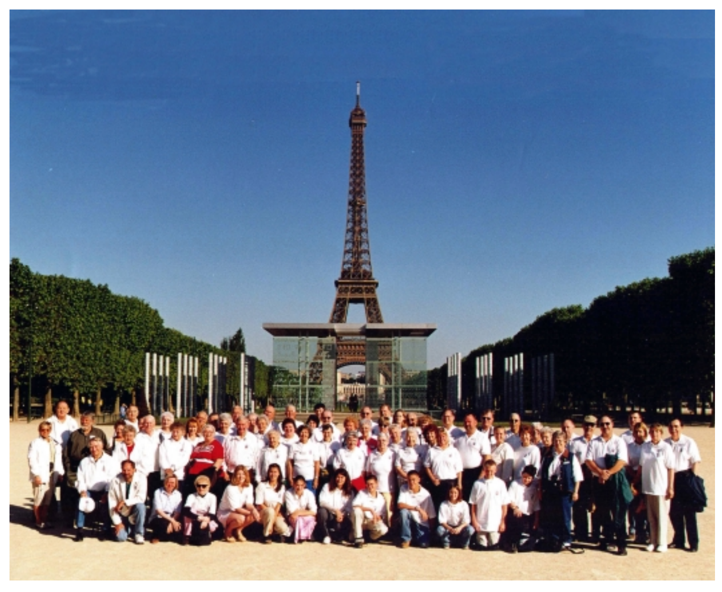
Group picture, in front of the Eiffel Tower, during the Heymann Historical Society's 4th Cousins Trip to Europe, June 2001. For a list of those making the trip, see inside, page 11.

HEYMANN HISTORICAL SOCIETY 32972 THORNDYKE COURT FARMINGTON HILLS, MI 48334